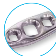
Misure chiave fisse 8.5-9.5-13mm