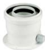
Vertical adapter PP-PP