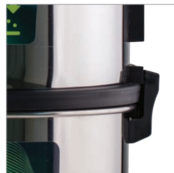
MANIGLIA ERGONOMICA ERGONOMIC HANDLE