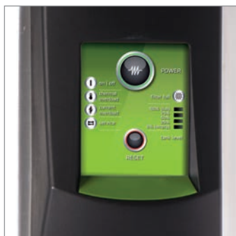
PANNELLO DI CONTROLLO CHECK PANEL