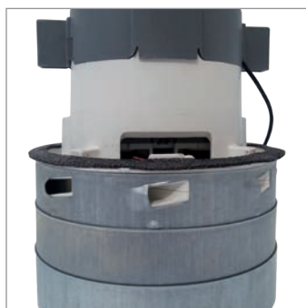
MOTORE TRISDADIO BY PASS THREE STAGE BY PASS MOTOR