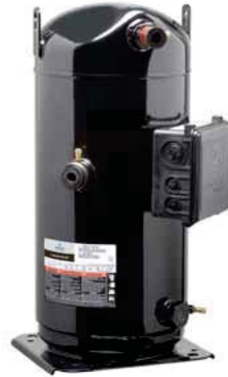
ZP Scroll Compressor

ZP104, ZP122 and ZP143KCE compressors for light commercial systems have a reduced footprint and weight for more compact systems. Their high efficiency helps to reduce operating costs.